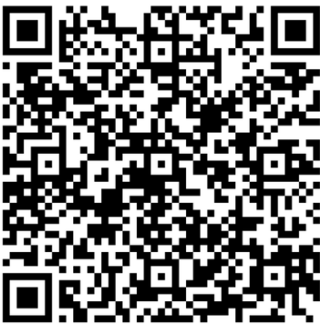
Nut Safer List 24-25